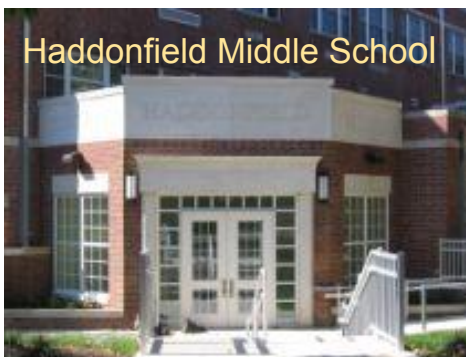
Haddonfield Middle School